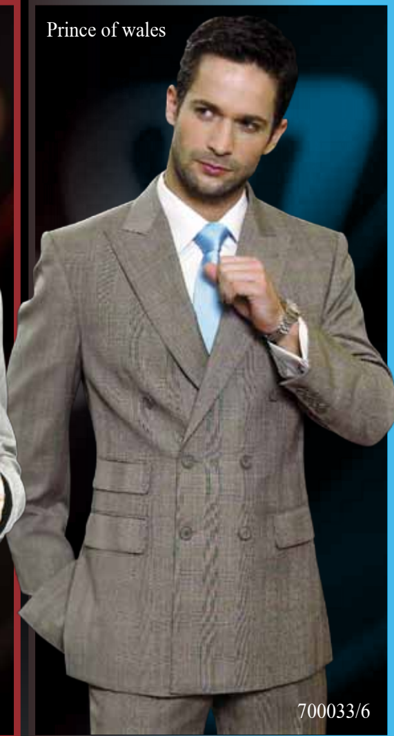
Prince of wales