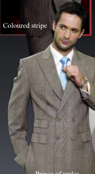
Prince of wales